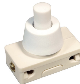
constant switch position